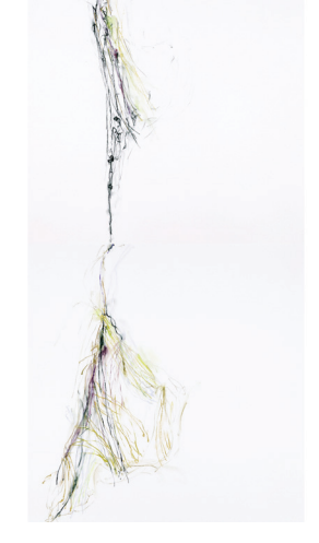
Fragile I, 2020 and Fragile II, 2020, pastel and pastel pencil on paper, 19 1/2 \times 19 inches each.

Fragile is an installation of abstracted leaf "portraits." With pastel drawings pinned across the gallery walls at fluctuating intervals and heights, the installation forms a rhythmic narrative, punctuated by lightness and gravity. Each piece is linked to the whole by line and placement, mirroring how we see leaves in nature. A column of dense, monochromatic line drawings suggests a tree.